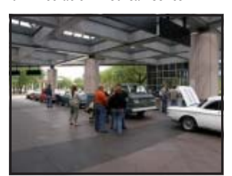
Corvairs at the Main Entrance of the VA Hospital